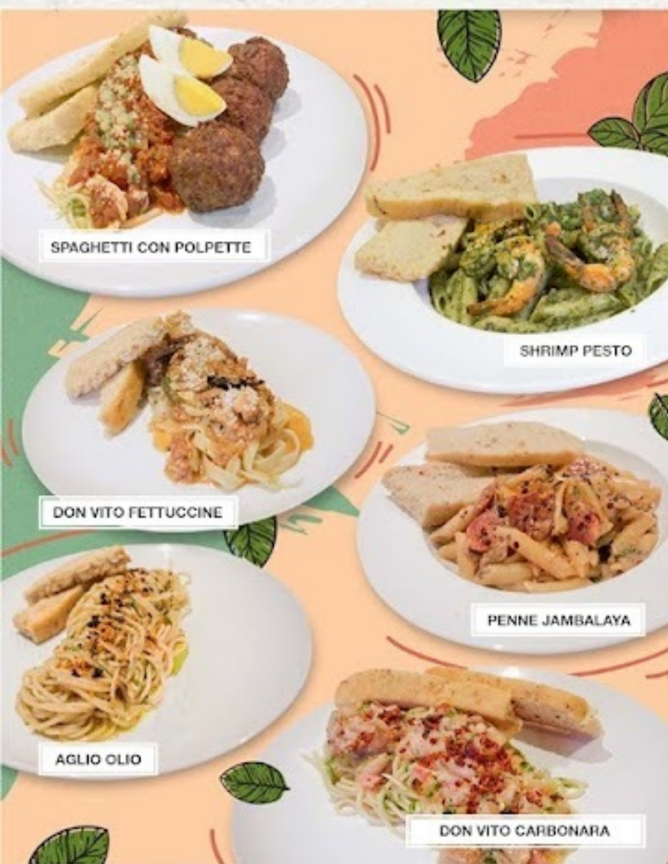
SPAGHETTI CON POLPETTE