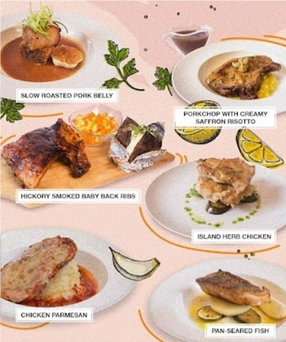
SLOW ROASTED PORK BELLY